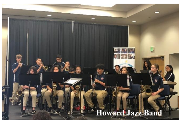
Howard Jazz Band