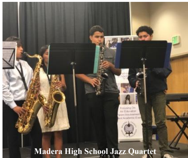
Madera High School Jazz Quartet