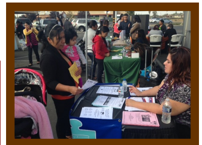
Community Outreach Fair Reached out to 200 + Contacts