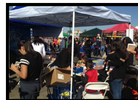
Pomegranate Festival Reached out to 350 + Contacts