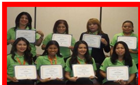
Camarena Health Center Promotoras