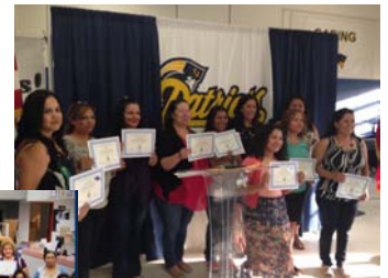
Thomas Jefferson M.S.