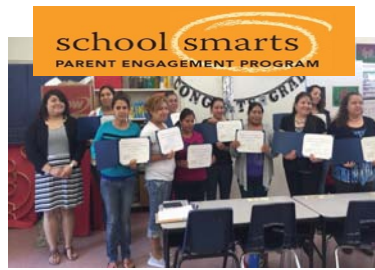
La Vina Elementary

Parent Engagement is on the rise. Parents have been exposed to a variety of great parent involvement programs that have helped expand their knowledge and open the lines of communication between students, parents and the community. It is great to see the pride of each parent as they celebrate their own milestone after graduating the various comprehensive programs offered through MUSD schools.